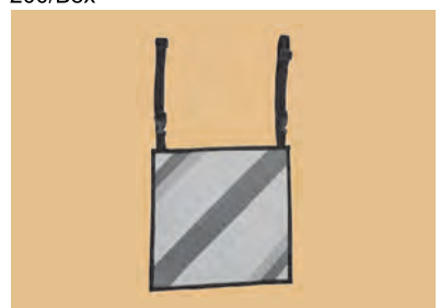
NO.1429 WARNING REFLECTING SIGNS

For driving with adjustable strap & plastic quick release buckle. Size:30x30cm(12"x12") 50/Box